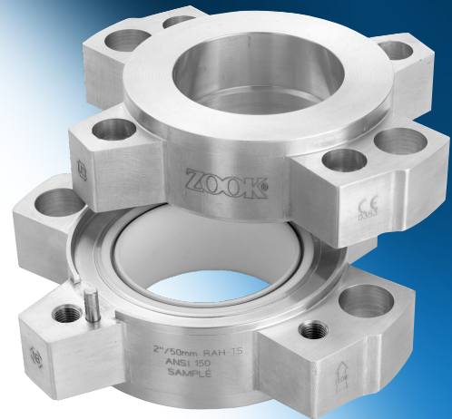
View of the inlet holder disk face This shows PTFE Sleeve Inlet, and O-Ring Seal