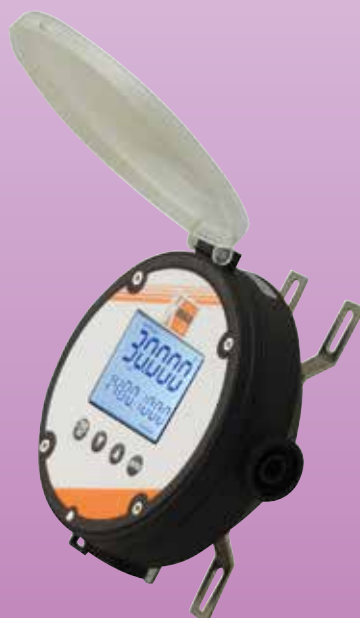
Wall mounting kit