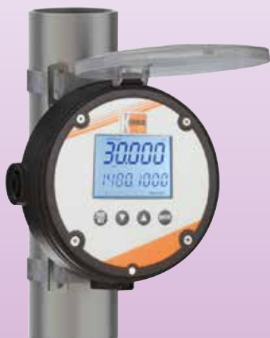
2" pipe mounting kit